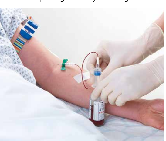
\ensuremath{\mathsf{BD}} Integrated Diagnostic Solutions.

BD provides solutions from collection to results, to drive impactful outcomes in patient and healthcare worker safety through reducing diagnostic errors, improving efficiency and integrated