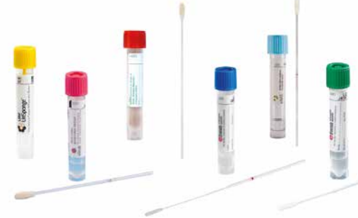
Don Whitley Scientific.