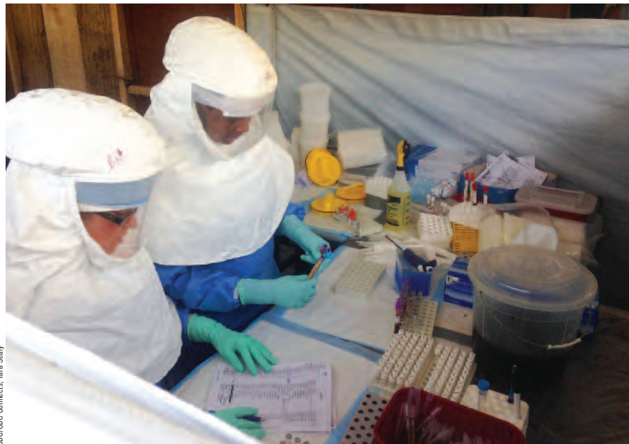
Two members of the international Ebola epidemic response working in Sierra Leone.

chronic and/or re-infection may have been occurring, which questions our traditional understanding of the clinical course of infection of S. flexneri .